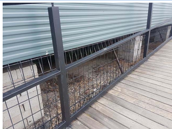
Photo 6. Exterior, subfloor – no access at the time of the assessment.