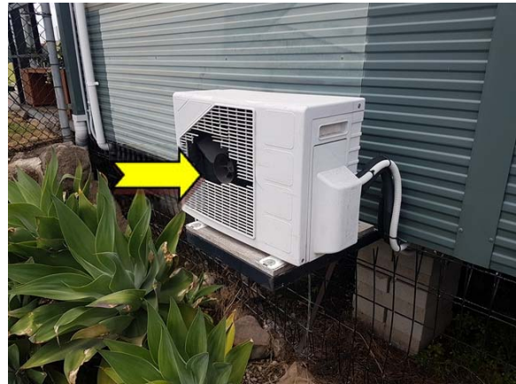
Photo 4. Exterior, west elevation, air conditioning unit – suspected ODS-containing unknown refrigerant gas.