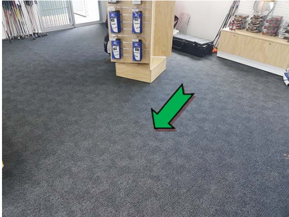
Photo 1. Interior, under carpet, floor coverings (blue) – non asbestos-containing vinyl sheeting.