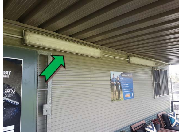
Photo 2. Exterior, throughout, double tube fluorescent light fitting– suspected non PCB-containing capacitor.