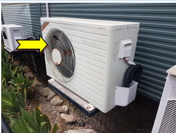
Photo 5. Exterior, west elevation, air conditioning unit – suspected ODS-containing unknown refrigerant gas.