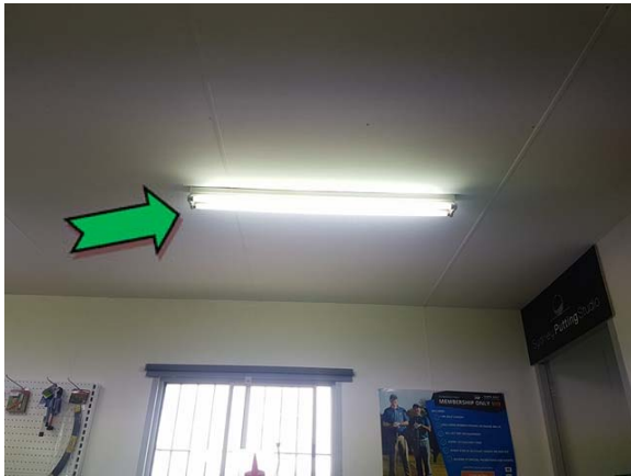
Photo 3. Interior, throughout, double tube fluorescent light fitting – suspected non PCB-containing capacitor.